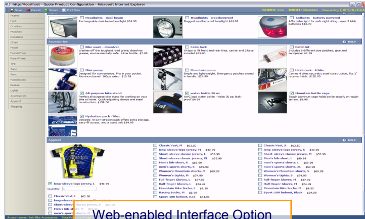
Web-enabled Interface Option

The Design Center, powered by the Experlogix Prodigy Configuration Engine , allows an administrator to set up parts and product categories along with associated formulas that completely define the valid configurations for each product. Once defined, a button is added to the Business One sales order screen for users to easily configure orders. When a user selects the configure button, the system prompts for the customer-defined models of the product to be configured. The professional version offers rules-based configurations.