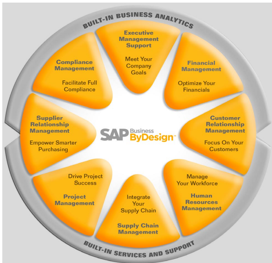
Figure: SAP® Business ByDesign™: A Complete and Adaptable Business Solution

SAP Business ByDesign links business operations such as purchasing, manufacturing, and sales to processes that support cash-flow management and financial and managerial accounting. The result is a single set of trusted, up-to-date data you can use to view business status, perform financial reporting,